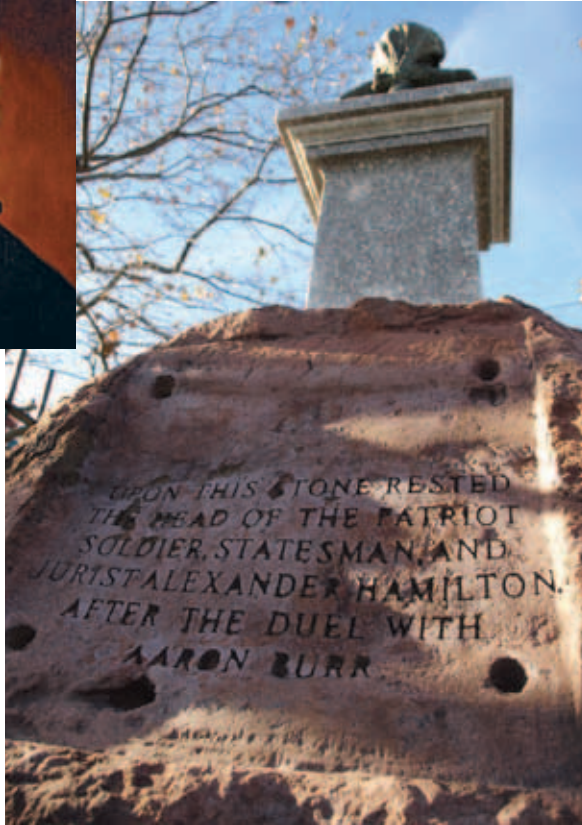
This memorial stone was placed where "the patriot, soldier, statesman, and jurist Alexander Hamilton" was felled by assassin Aaron Burr. The root of the chronic British corruption of the Presidency of the United States, LaRouche writes, is properly to be located in the fact and implications of the assassination of Hamilton, by Burr.