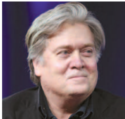
Former Chief White House Strategist Steve Bannon.