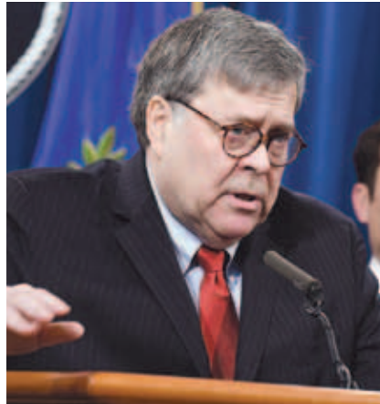
Attorney General William Barr.

With that, I'm happy to take a few questions. I'm on my way to a speech, but I'm happy to entertain questions while I can.