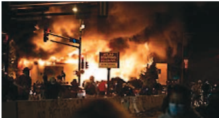
In the dark of night, a small group turned a protest against the police murder of George Floyd into a violent conflagration, Minneapolis, May 29, 2020. The citizens of U.S. cities, who were subjected to burning and looting, completely reject the violence and vandalism.

It is for these reasons—despite the fact that there are social tensions and political polarization in the U.S. that