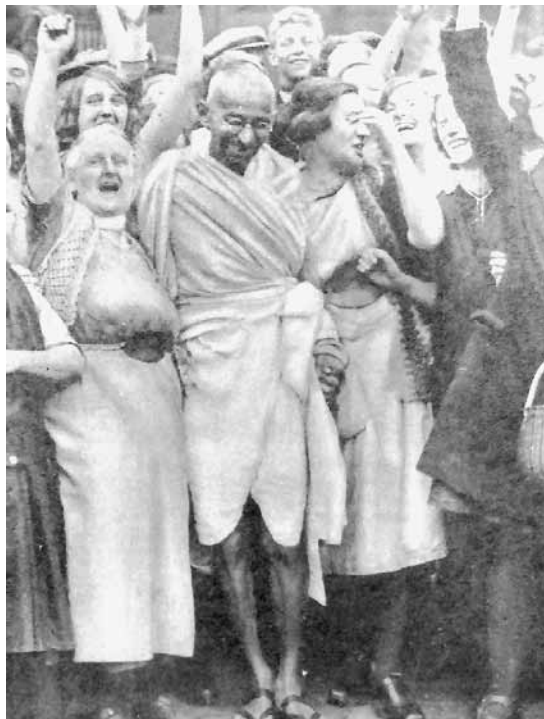
Gandhi is shown here being given a rousing reception by textile workers in Darwen, Lancashire, England, September 26, 1931, during the Swadeshi boycott of British cotton goods called by the Indian National Congress in 1929.

As soon as these projects take on a concrete