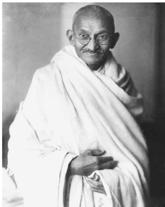
Mohandas K. Gandhi, 1931.

According to the UN International Labor Organization (ILO), this year 500 million jobs will be lost, and if the prognosis of the Executive Director of the UN World Food Programme (WFP), David Beasley, 2 turns out to be right, we could face a famine of biblical dimensions soon, killing up to 300,000 human beings a day. 3