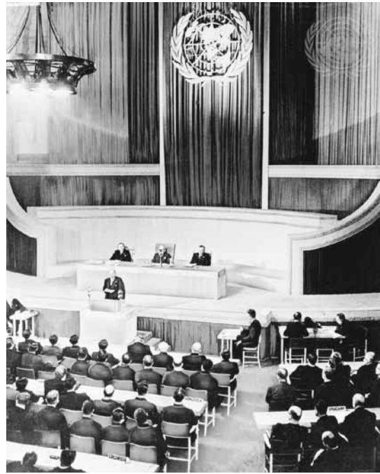
UN The world community expressed its fervent desire for nuclear disarmament in its first Resolution at the first session of the United Nations General Assembly in 1946.

As we commemorate this year the 75th anniversary of the adoption of the UN Charter, it is more urgent than