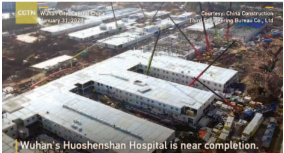
"The coronavirus would not have become a pandemic if every country had a modern health system." Shown, the Huoshenshan Hospital under construction, built in record time in Wuhan, China, January 2020.

There is one important lesson to be learned from the present crisis: The coronavirus would not have become a pandemic if every country had a modern health system. After the outbreak in Wuhan and Hebei province, the Chinese health system was capable of being geared up, rapidly building new hospitals in a few weeks, and mobilizing health professionals from around the country. After two months, China had the pandemic essentially under control and has been able to prevent a new outbreak ever since. If every other country would have had the same capability, it would not have become an out-of-control pandemic.