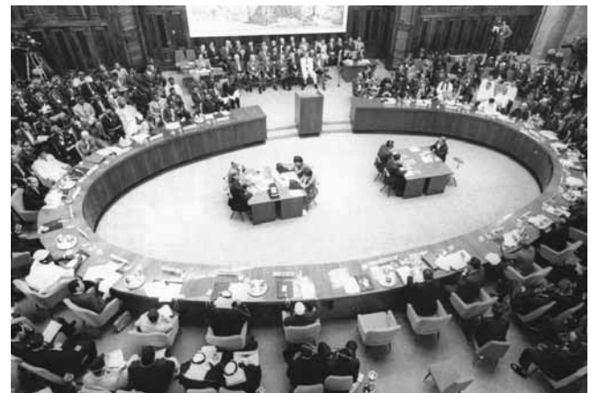
Gandhi’s philosophy of peaceful coexistence was continued in the first summit of the Non-Aligned Movement in Belgrade, 1961.

The principles of Gandhi’s conception of non-violence continued to influence later the Five Principles of Peaceful Coexistence, Panchsheel , as it was expressed for the first time formally in the “Agreement on Trade and Intercourse between the Tibet region and India” on April 29, 1954. In the preamble, these principles were spelled out: (1) Mutual respect for the territorial integ-