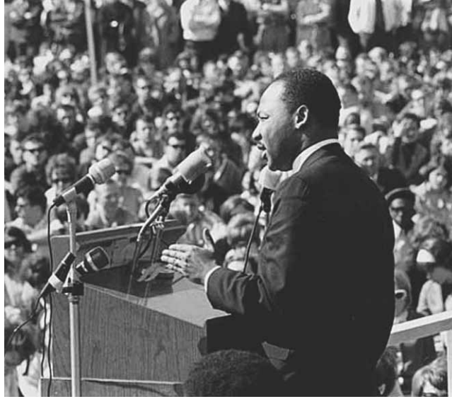
Minnesota Historical Society