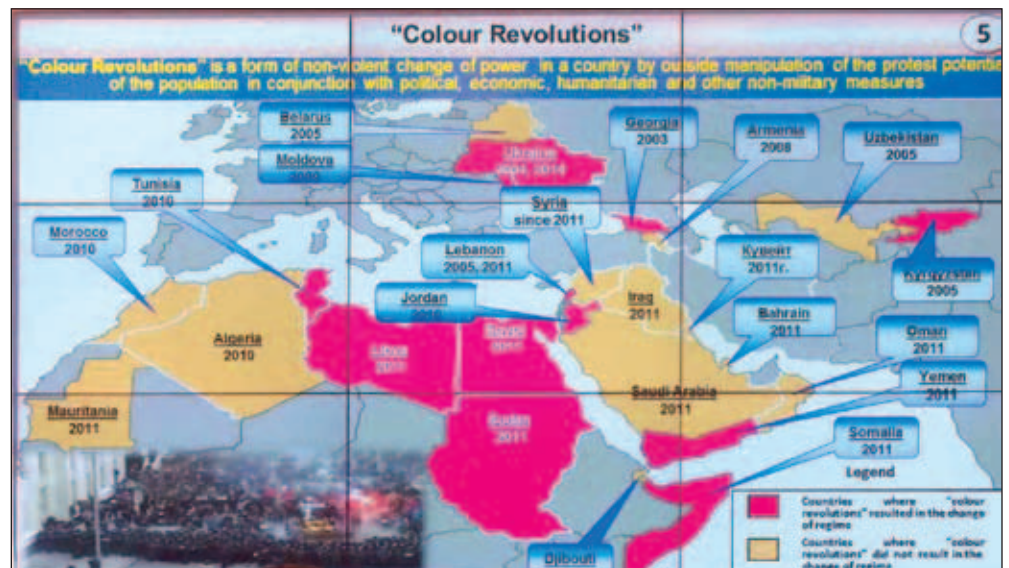
Russia Ministry of Defense

Map from the presentation of Gen. Valery Gerasimov, Chief of General Staff of the Armed Forces of the Russian Federation and First Deputy Minister of Defense, Third Moscow Conference on International Security, May 23, 2014.