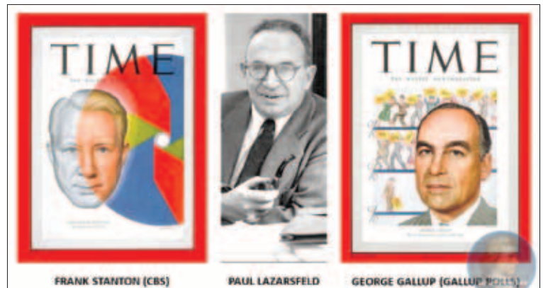
Three notables of Sociometry, a nexus of media, polling, public relations, and opinion research: pollster George Gallup of the Gallup Organization; Frank Stanton of CBS; and sociologist Paul Lazarsfeld.

Sociometry is relevant to look at because they were kind of a nexus point of media, polling, public relations, opinion research, all these different elements. Other notable members of Sociometry included John Dewey and some of the Tavistock crowd—Kurt Lewin, Margaret Mead, Paul Lazarsfeld. And then on the media side was Frank Stanton of CBS, and there was Gallup of Gallup Polls. Lazarsfeld, Frank Stanton, and Gallup were part