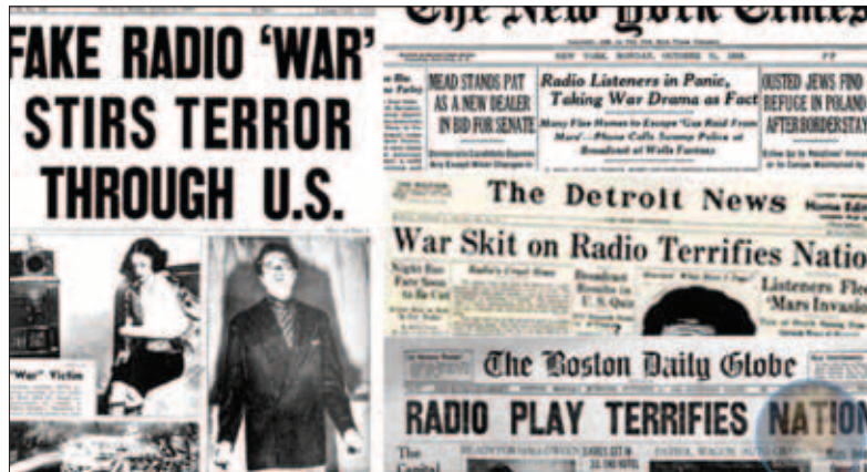
Some newspaper headlines on the 1938 radio broadcast, “War of the Worlds,” a psychological warfare experiment conducted by the Princeton Radio Research Project.