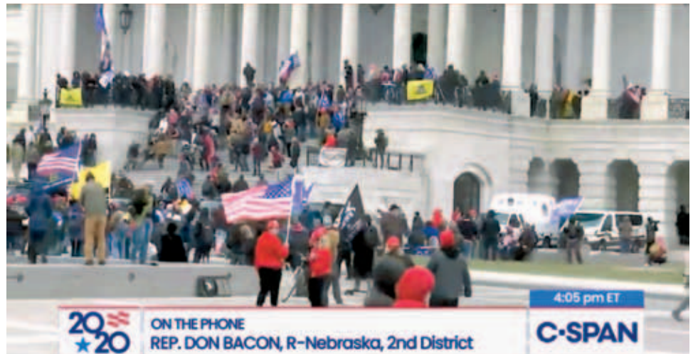
Demonstrators outside the U.S. Capitol Building on January 6, 2021 to protest the vote fraud against President Trump.

mediately following this presentation]. What happened is incredible: It’s a huge danger. The danger is truly much bigger than the ordinary citizen suspects. What happened on January 6th was the beginning of a new global fascist danger. It can lead to an incredible strategic escalation with Russia and China, but it can also open up something that can be defined as a solution. But first we have to identify exactly what happened.