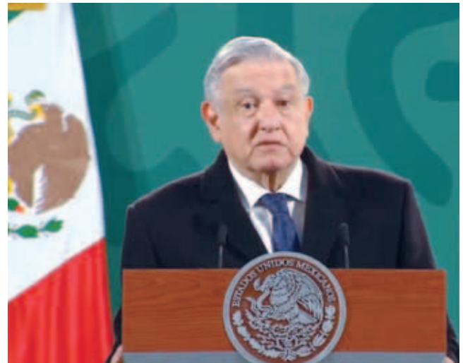
Government of Mexico

there are some people who probably think, “Oh, that’s a good thing! We didn’t like Trump in the first place.” But look at what President López Obrador of Mexico said in a press conference, Friday. He said,