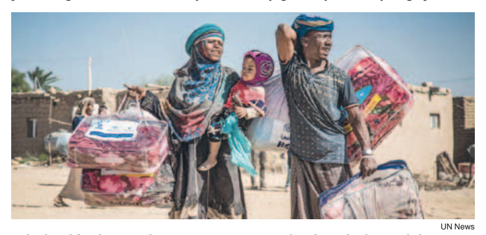
A displaced family in Marib, Yemen, carries winter aid packages back to its shelter.

And what was the result? It was a ridiculous $1.7 billion which is less than last year. And if you think about the trillions of dollars and euros which are being wasted and spent to save the speculators, to save a bankrupt