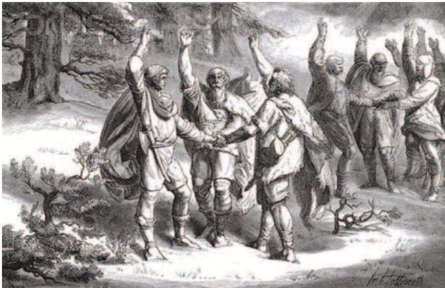
At a crucial moment in Friedrich Schiller's drama Wilhelm Tell, the men declare—in the famous “Rütli Oath”—their belief in natural law in the universe, to which they can appeal to defeat tyranny.