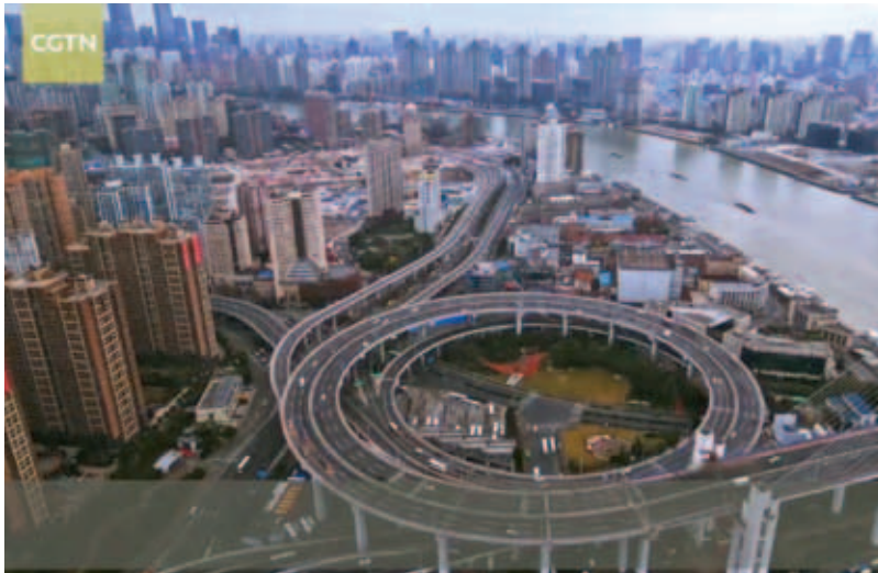
A vigorous domestic economic development policy has positioned China to assist other developing countries to go in the same direction. Shown: an aerial view of Shanghai, China.

countries should learn from. We have discussed this in the past. In many ways, what the Chinese economic model has accomplished is very much like the early American System of economy of Alexander Hamilton. It's just a much more dirigist approach. But that used to be the approach of the Western economies; that was the method of the German economic miracle which helped to reconstruct Germany after World War II. Germany, after World War II, had the same kind of dirigist orientation as China now has. So, there are a lot of myths, but I think the narrative that China is the enemy is completely false. And the Chinese government has said many times that there is no basis in reality to portray China and Russia as such enemy images. Their policies are not doing what they are being accused of, and if there were a willingness by the West to cooperate in solving the world's problems, all these purported dangers would vanish practically overnight.