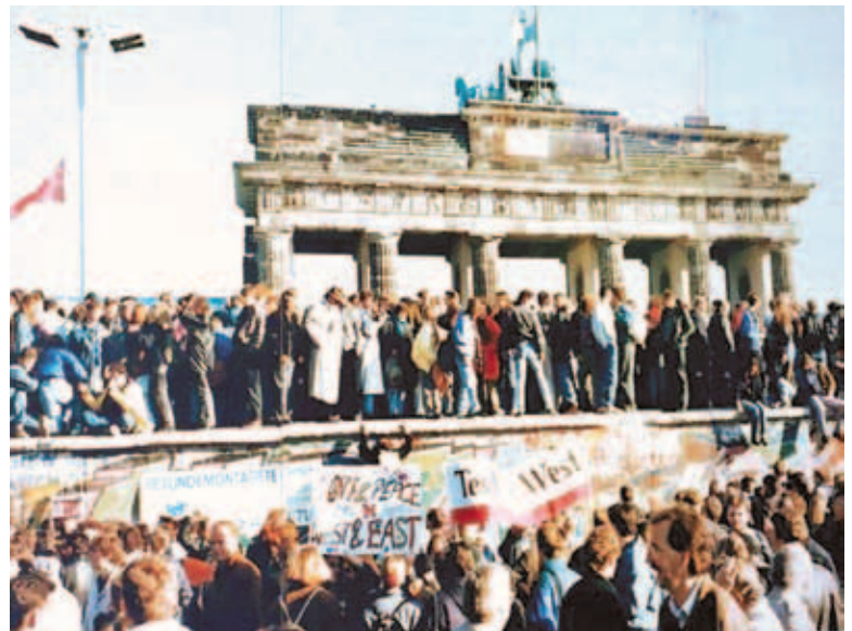
The fall of the Berlin Wall in 1989, followed by German unification, opened for a very short time the potential for a peace order of Eurasian economic construction.

Berlin Wall in 1989, where, for a very short period of time, with the German unification following, there was a potential to establish a peace order, because communism had just vanished. That opportunity was missed for geopolitical reasons. This is a whole other subject, but there was a short moment of maybe several months, a potential that it could have led to the Eurasian Land-Bridge. What we see with the New Silk Road today, we suggested that when the Soviet Union collapsed. It would have totally