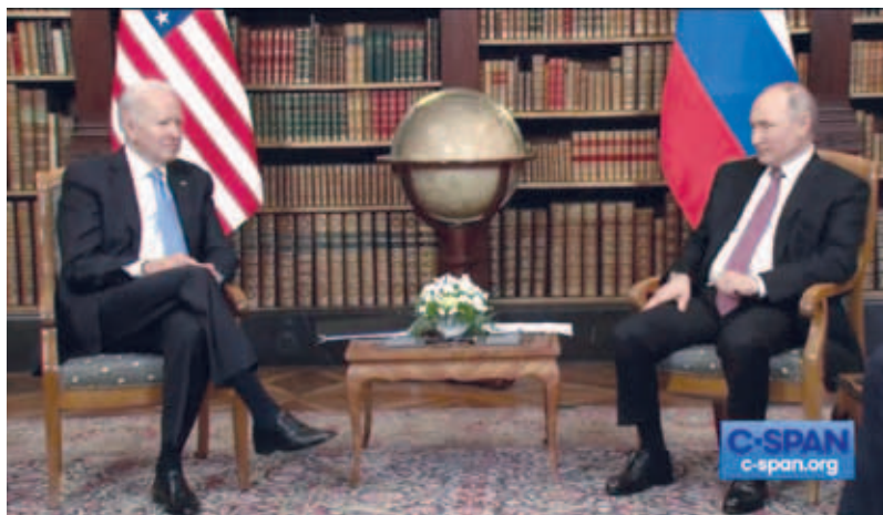
Even as President Biden met with Russian President Putin on strategic stability on June 16 in Geneva, he stated that Russia and China could become “mortal competitors” down the road.

Zepp-LaRouche: I think any reasonable person on the planet hopes that that is the case. I think it's a tiny, baby step in the right direction, that these strategic stability talks are taking place in Geneva. But unfortunately, that's not the whole picture. President Biden, almost at the exact same time, had a meeting in the offices of the National Director of Intelligence, Avril Haines, a meeting with many representatives of the intelligence community, in which he said yes, we have to cooperate—meaning the United States with Russia and China. And there are areas where such cooperation is necessary. But he also said that these countries could