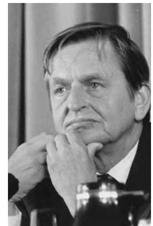
When Swedish Prime Minister Olaf Palme was assassinated in 1986, the fake news story all over the U.S. media was that LaRouche and his associates were responsible.

ted to what they called the “controlled disintegration” of the Western economies. That’s been unfolding since the Carter administration. LaRouche also played a leading role in identifying what was behind the terrorist assault in that period, the deployment of terrorists by NATO, by the CIA, including Operation Gladio, which was tearing apart Europe in the 1980s.