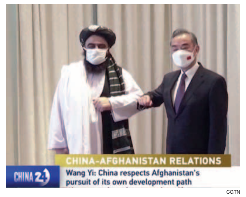
Wang Yi, China's State Councilor and Foreign Minister, meeting in Doha, Qatar with Amir Khan Muttaqi, Acting Foreign Minister of the Taliban's Interim Government of Afghanistan. October 26, 2021.

The Chinese Foreign Minister Wang Yi just met in Doha with the Taliban, with interim Acting Deputy Prime Minister Abdul Ghani Baradar and acting Foreign Minister Amir Khan Muttaqi, and Wang Yi ap-