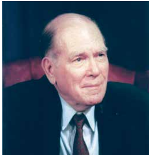
Lyndon H. LaRouche, Jr.