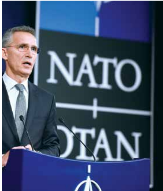
Jens Stoltenberg, Secretary General of NATO.

In net effect: NATO has ceased to serve any vital strategic interest of the United States, and, its degenerated nature has made it, in fact, an instrument employed by forces working against our vital interests. Exemplary is the already referenced case of those Balkan wars, which were organized as a geopolitical action, by the joint initiative of the governments of Prime Minister Margaret Thatcher and France's President François Mitterrand. Since no later than 1992, the leading explicit adversary of the most vital U.S. strategic interest, has been the resurrection of King Edward VII's Entente Cordiale, by Thatcherite London and François Mitterrand's Paris. Under the influence of that revived London-Paris alli-