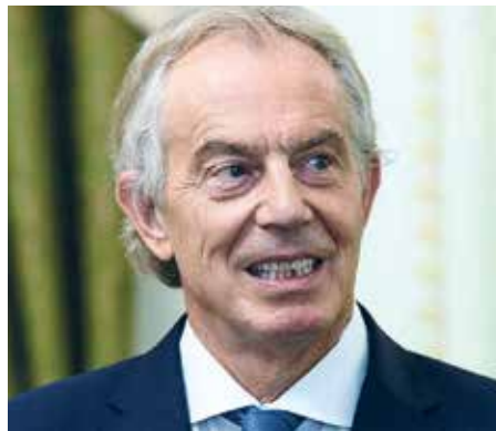
Government of Ukraine

The fight that's being waged is not about Ukraine per se . The people of Ukraine are, rather, the victims of the NATO-U.S. drive to crush Russia. And that's something you should remember when you're watching this on television. You're being induced to support a war that ultimately is going to take away your freedom.