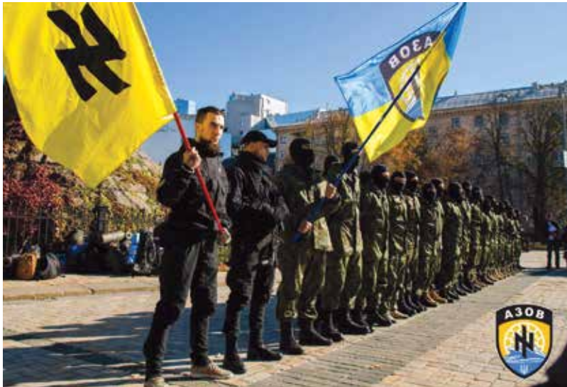
Azov Battalion VK Page

Although the Azov Battalion's ideology is neo-Nazi, the Atlantic Council insists it must be accepted because it is "an integral part of Ukraine's official state structures."