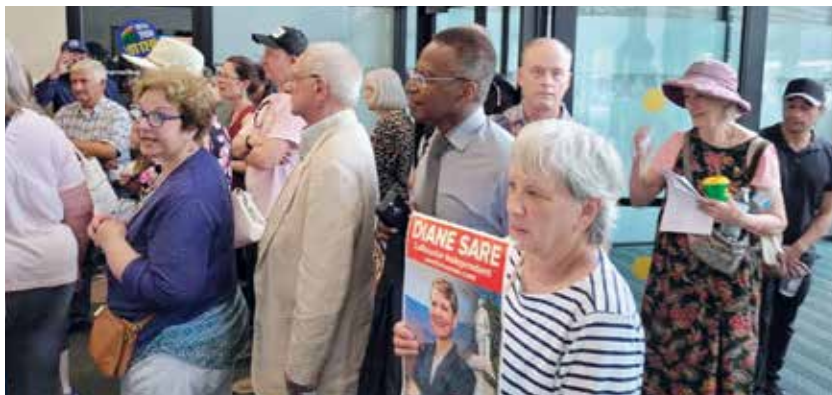
Sare for Senate

But the big question everybody has in mind, or if they don't think about it, it is the background: Can the United States be brought into a combination of countries that addresses the fact that the financial system is about to blow out in a hyperinflationary collapse, or