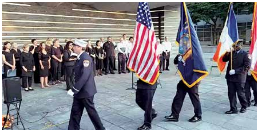
The FDNY Ceremonial Color Guard, presenting the flags for the National Anthem, sung by the Schiller Institute NYC Chorus.