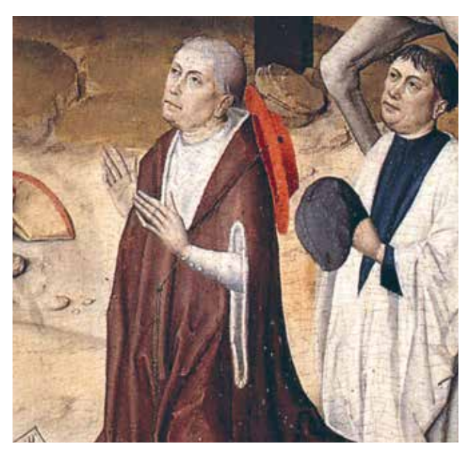
Nicholas of Cusa's idea of the Coincidence of Opposites provides a way to bring the political, economic, and social order into coherence with the laws of the physical universe, by always considering the higher power of the One over the Many.

https://store.larouchepub.com/EIR-Daily-Alert-p/eirpk-0000-000-00-001-std.htm