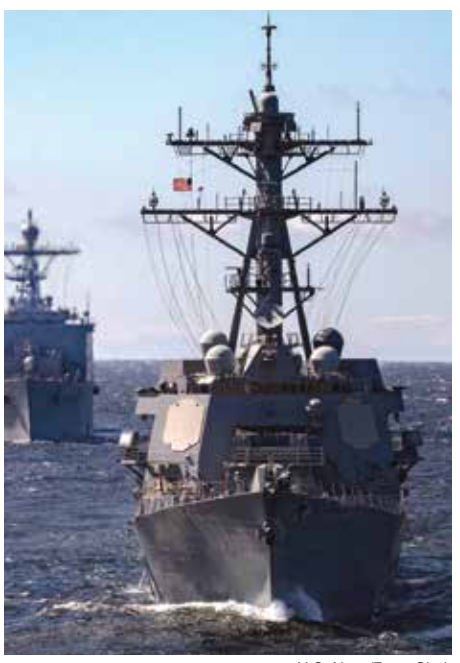
The USS Kearsarge during the May 17, 2022 BALTOPS22 exercise in the Baltic Sea.

This is absolutely scandalous. Think about it: The so-called "best ally" of Germany is blowing up pipelines which not only creates incredible economic damage—it drives the energy prices up, it makes the lives and livelihoods of many people very difficult. Many people cannot pay the cost of energy now. It's an act of war! There were several people, including Scott Ritter, former UN weapons inspector in Iraq, and others who have said this was an act of war. According to Hersh, there was an incredible effort to craft this effort, including using non-covert forces to avoid congressional reporting. That type of maneuvering is of lesser importance, but the implications are enormous. I was interviewed by Garland Nixon, a very important U.S. commentator, and in the interview he pointed to the fact that a NATO maneuver, "BALTOPS 22," which had as its focus the protection against a Russian aggression of NATO members, was used as a cover story to commit an act of war against one NATO member, Germany, and