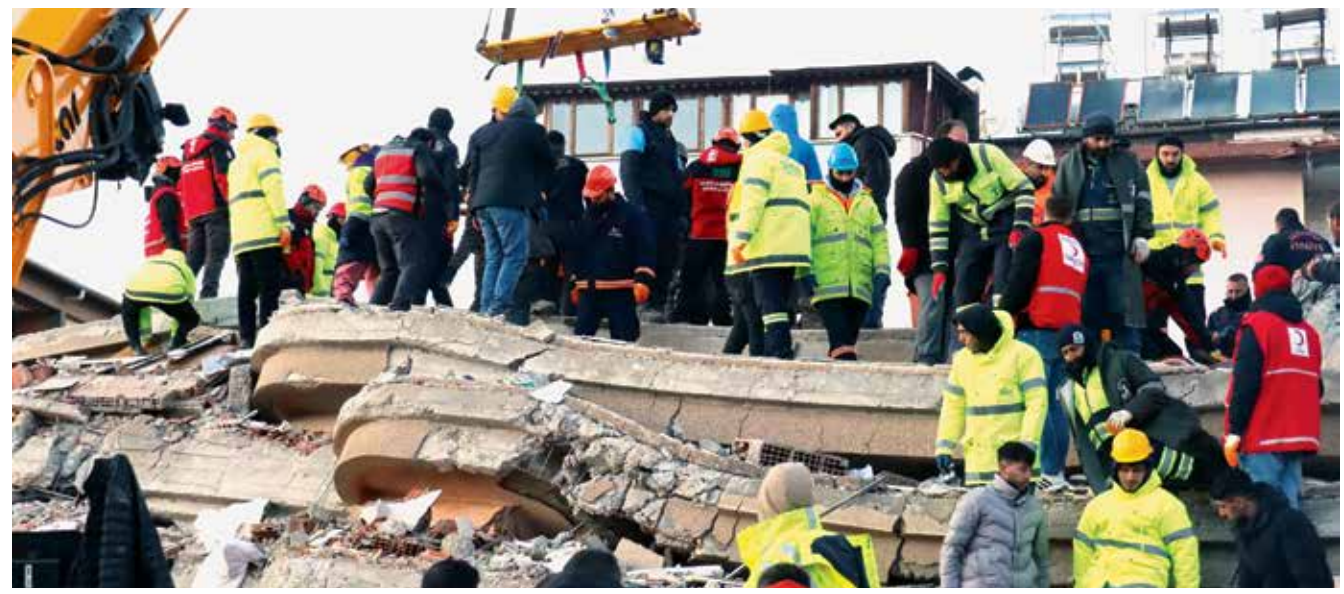
The Anglosphere is weaponizing the earthquake that has killed upwards of 50,000 in Türkiye and Syria, to the point of using it, if possible, to re-start armed conflict in the area. Shown: searching among the collapsed buildings in Gaziantep, Türkiye, Feb. 7, 2023.

has caused nearly 50,000 deaths in Türkiye and Syria: "The United States—and the Anglosphere more broadly—continues to weaponize the earthquake, even to the point of using it as the occasion to, if possible, re-start armed conflict in the area. The United States has so far not lifted its notorious Caesar Sanctions. thus prohibiting a full international effort to respond to