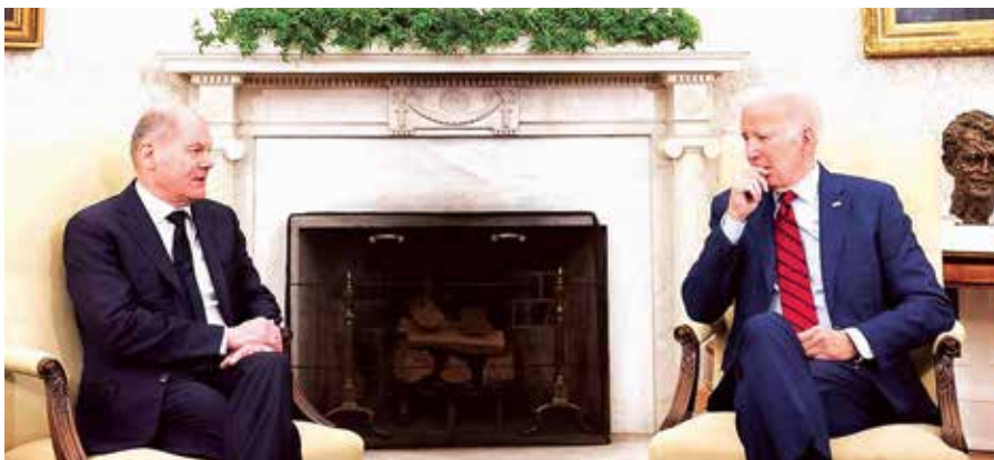
When President Biden stated on Feb. 7, 2022, “There will be no longer a Nord Stream 2,” German Chancellor Scholz only said: “We are doing everything together.” This photo is from their meeting at the White House, March 3, 2023.

Now, this is all extremely ominous. Seymour Hersh