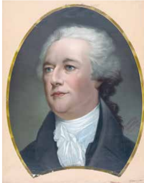
After a painting by John Trumbull