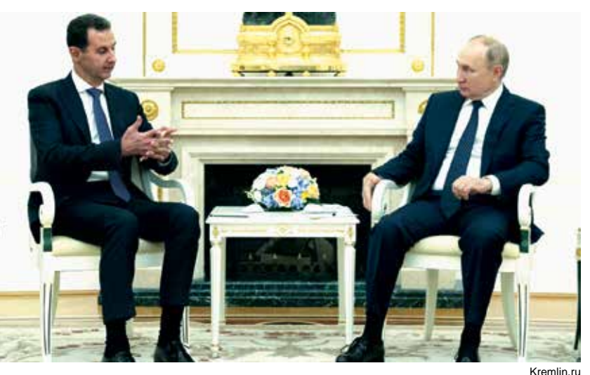
Presidents Bashar al-Assad and Vladimir Putin met in Moscow March 15, 2023 to discuss humanitarian aid, Syria-Türkiye relations, and economic cooperation.

The new road to regional stability and development