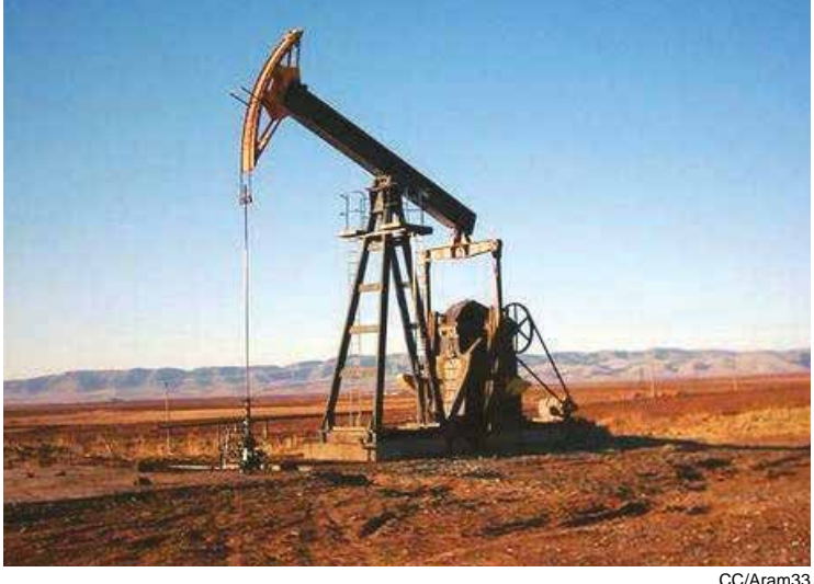
The U.S. and its allies have been stealing an average of 66,000 barrels of oil per day from Syria. Shown: a pumpjack in Syria's Rmelan oil fields.

The bulk of oil production is located in that portion of the northeastern governorate of Deir Ezzor, east of the Euphrates River, which is under the control of the Syrian Democratic Front (SDF), whose military arm is led by the People's Protection Unit (YPG), a Kurdish