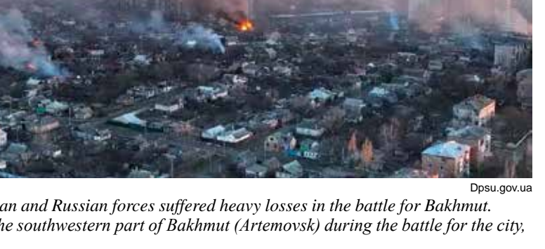
Both the Ukrainian and Russian forces suffered heavy losses in the battle for Bakhmut. Here, a view of the southwestern part of Bakhmut (Artemovsk) during the battle for the city, April 2023.

Casualties were enormous. Russians and Ukrainians both claimed the other side suffered disproportion-