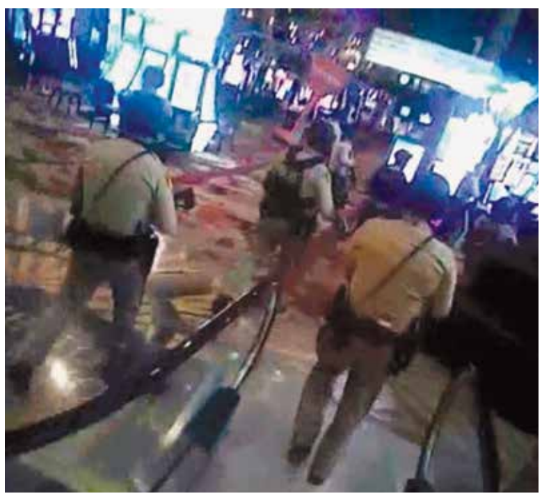
Las Vegas Metropolitan Police Department

As of May 2023, an estimated 3.6-3.7 million people have died indirectly. The total death toll in these war