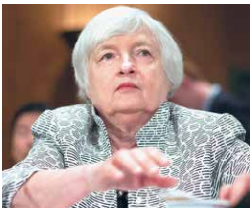
Janet Yellen, U.S. Treasury Secretary.

set of sanctions against Russia. The EU website’s timeline included this statement: