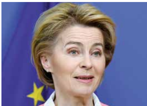
European Commission Ursula von der Leyen, President, European Commission.

Feb. 23, European Union: The EU Council adopted its first