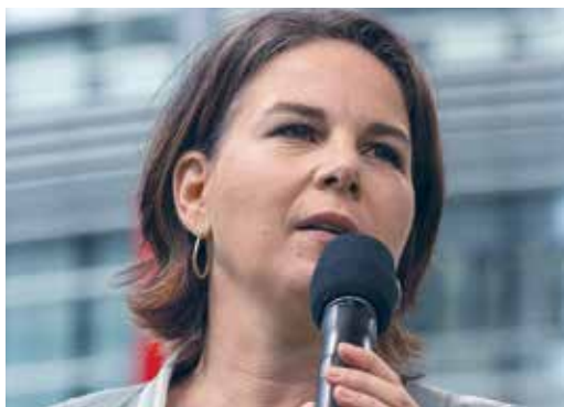
Die Grünen Annalena Baerbock, German Minister of Foreign Affairs.