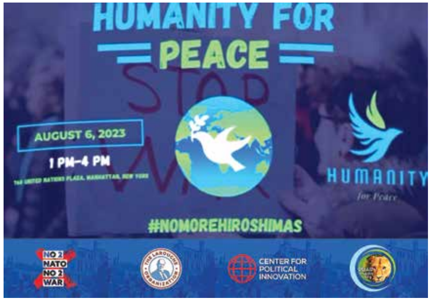
Humanity for Peace

Zepp-LaRouche pointed to the newly announced decision by President Joe Biden to deploy cluster