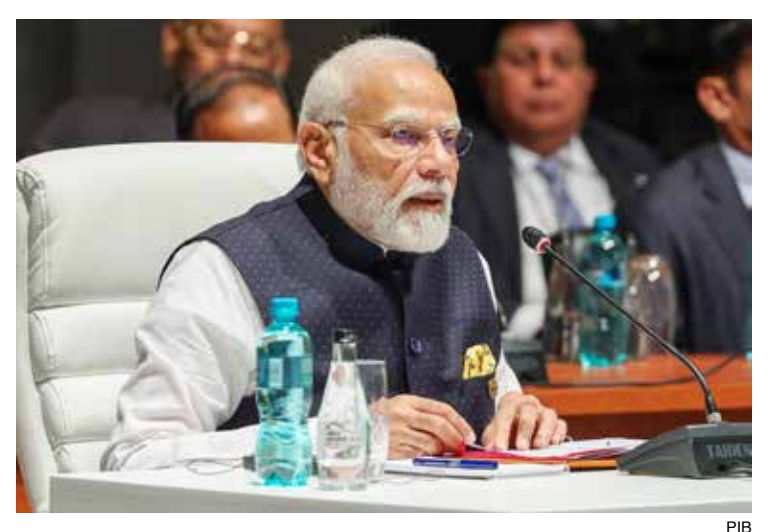
India's Prime Minister Narendra Modi watched his nation's triumphant lunar South Pole landing during the Summit, and pushed for cooperative scientific, space, and education programs on Earth.

For example, the offer of membership to Iran —perhaps the most U.S./NATO-sanctioned and targeted nation in the world—was likely the biggest surprise; it