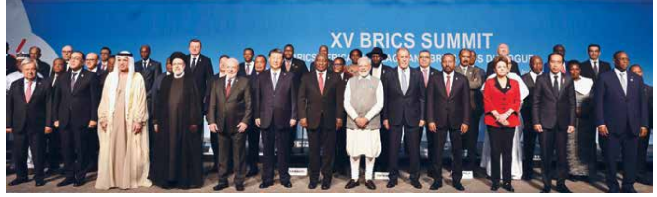
BRICS X Page

The 15th BRICS Summit marked a tectonic shift in global relations. At top are leaders of the five BRICS nations. Below: Leaders of the five with representatives of the six newly admitted nations and of others seeking membership. Johannesburg, South Africa, Aug. 22-24.