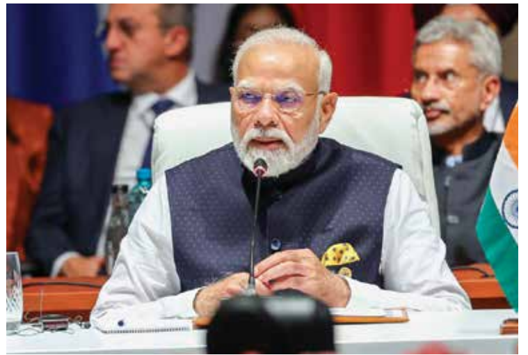
Press Information Bureau