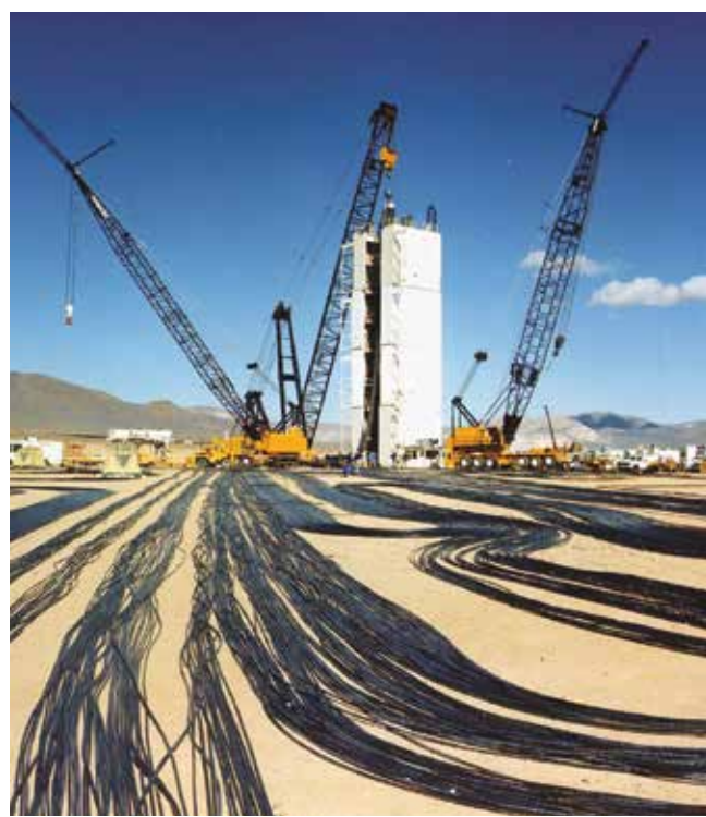
National Nuclear Security Administration