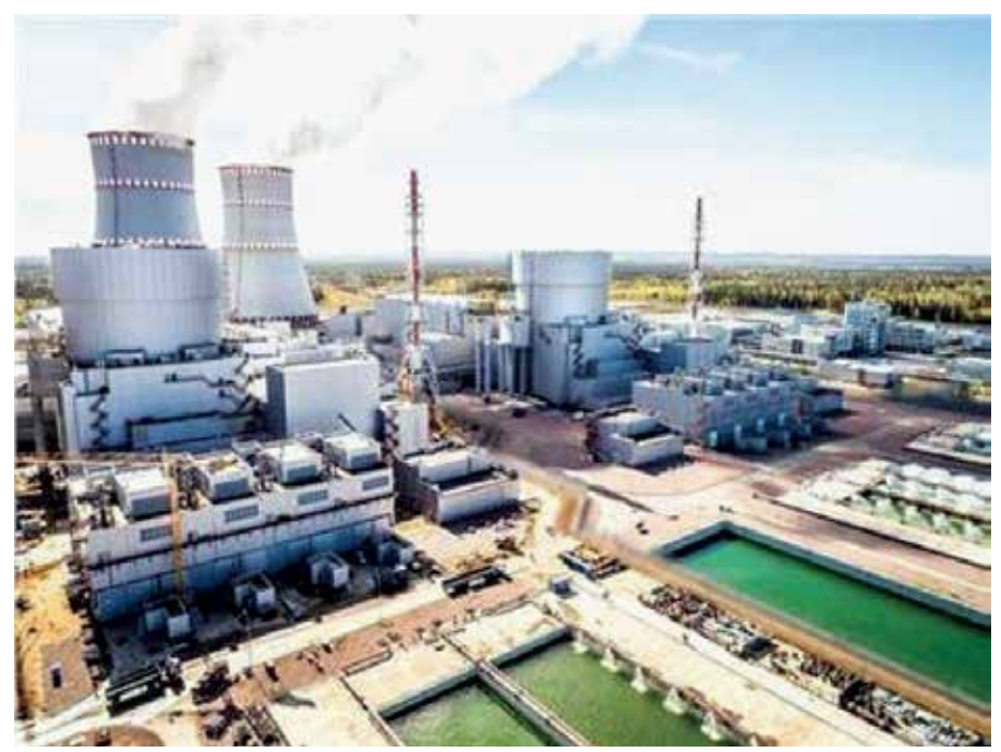
Egypt State Information Services

The BRICS thus now appears as an expanding group of politically very diverse leading nations of the developing sector, which share the characteristic of pursuing their national interests, their self-reliance and their sovereignty, and resisting geopolitical domination of the world by the "Global NATO" powers. They have