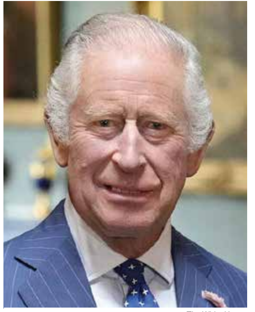
The White House King Charles III, Head of the Commonwealth of Nations, instigator of the Malthusian Green New Dead

Africa, as a clear defeat for that Green Deal. The bigger mission for the BRICS, and the numerous developing nations that want to join it, is the technological and educational leap to nuclear- and space-powered industrial development.