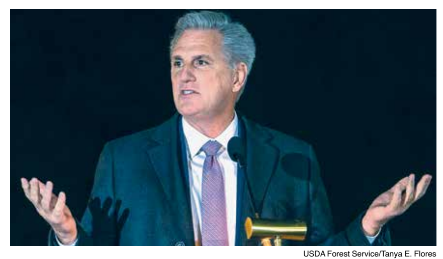
Republican Kevin McCarthy, the first Speaker of the U.S. House of Representatives ever to be removed by a vote of the whole House.

votes in the national election on Saturday, Sept. 30 and a sign of life for the anti-war movement in Germany, where support is growing for a proposal for a negotiated