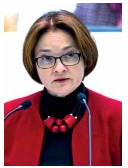
CC/Council of the Russian Federal Assembly The neoliberal financial monetarist, Elvira Nabiullina, Governor of the Bank of Russia, whose policies have sabotaged Russia's economic development.

Now, Nabiullina felt compelled to attack the Chi-