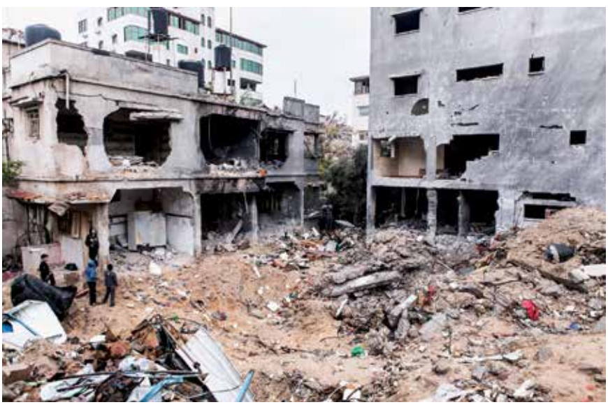
CC/Diario fotografico 'desde Palestina'

dent Macron, Italian Prime Minister Meloni, others, who are saying, no, there must be unilateral support for Israel. But that's not so self-evident: You can be for Israel, but what is Israel? If you look at all the leading papers, today, they all call for the resignation of Ne-