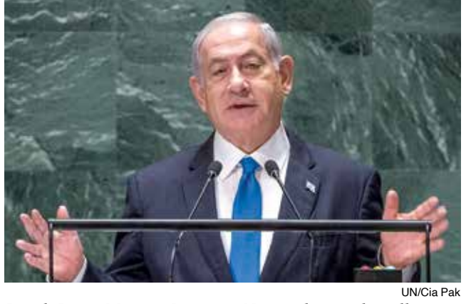
Israeli Prime Minister Benjamin Netanyahu says he will carry out a "mighty vengeance," a "complete siege" of Gaza, affecting its entire Palestinian population of two million.

The accusation coming from The Wall Street Journal, for example, and others, that Iran would have backed Hamas, other people who are very knowledgeable about the situation on the ground, clearly defy that, and say this is absolutely not the case. But Netanyahu has made statements in this direction. If it would come to an escalation involving all the different groupings, in Lebanon, in Syria, in