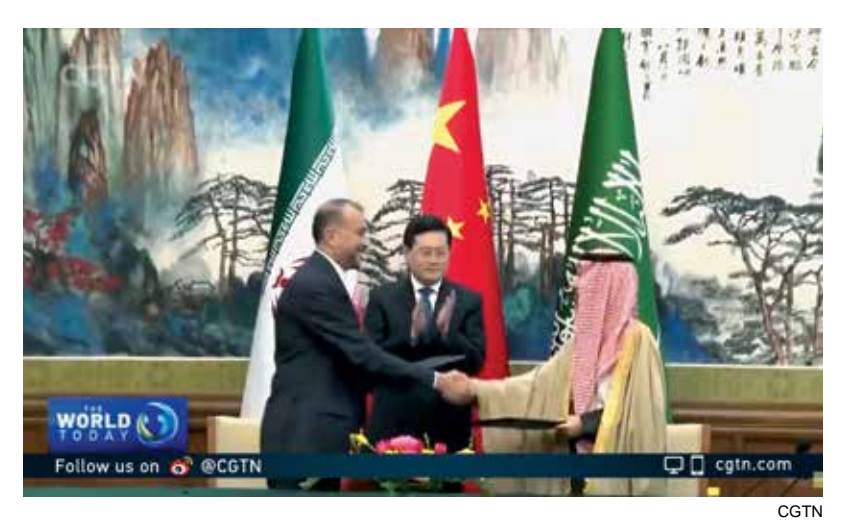
Chinese Foreign Minister Qin Gang with Iranian Foreign Minister Hossein Amir-Abdollahian (left) and Saudi Foreign Minister Faisal bin Farhan al-Saud (right), after the two signed a memorandum of understanding restoring diplomatic ties. Beijing, April 6, 2023.