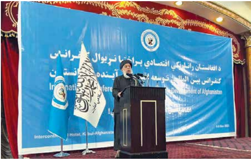
Schiller Institute/Jason Ross

there is a nationwide program of basic infrastructure like transport, energy, water manage-