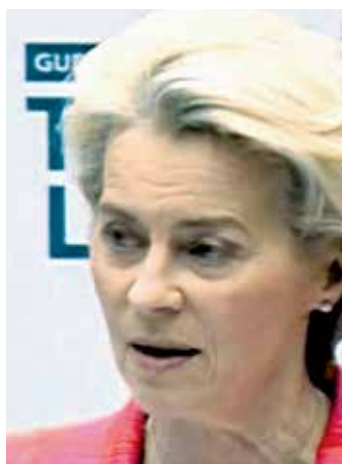
Ursula von der Leyen

Commission has given a green light (or not yet given a red light), so that Italian producers now demand the same treatment. According to the Milan daily La Verità , the Commission is rejecting an Italian request to postpone a total liberalization of the energy market in Italy.