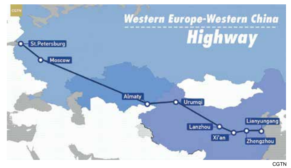
The 8,445 km Western Europe–Western China Highway connects China's Yellow Sea coastal city of Lianyungang to Russia's St. Petersburg on the Baltic. It was completed September 27, 2018, after 10 years of construction.

Siberian Railway from the Khanty-Mansi Autonomous Area toward the Trans-Siberian Railway and Baikal-Amur Mainline, and another Arctic-South corridor in the Far East. Putin also described how they also plan to modernize highways and construct new deep-water ports around the region. Summarizing these projects, Putin said: