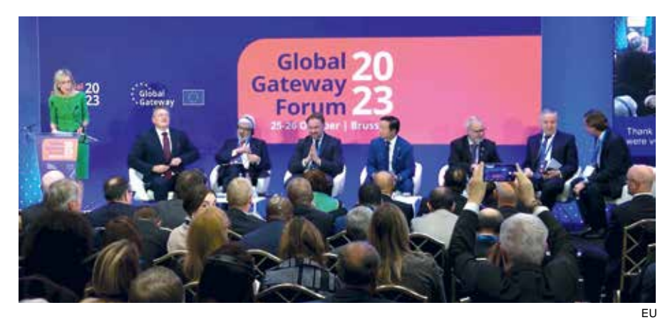
The European Union's Global Gateway Forum 2023 on green energy transition and green hydrogen, Brussels, Oct. 25–26, 2023, offered political sloganeering without much substance.

As we rise from this, we should be able to say the Grand Inga Dam is now going to be developed into a power station. If you can do that, we as Africans will be convinced that these summits are really meaningful. We will now go home and say "You know what? It's worthwhile going to these summits, coming to Europe and to listen to all the promises because they are willing to act on the promises."