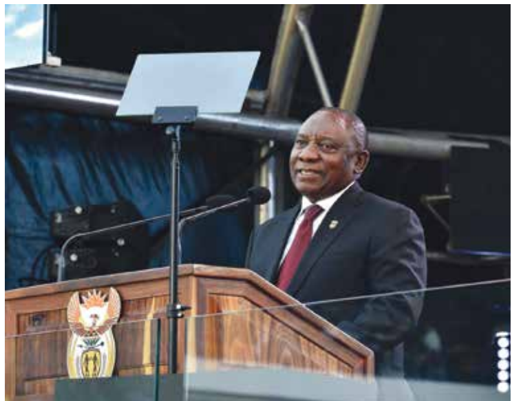
Presidency of the Republic of South Africa

China has shown interest in a wide range of power and water projects in different parts of Africa. The biggest such investment would be the first stage of the Grand Inga Dam. This stage, called Inga III, will generate 11 gigawatts of electricity, tripling the power generation capacity of the Democratic Republic of the Congo (DRC). This $14 billion project was to be financed and carried out jointly by Three Gorges and Sinohydro from China and the Spanish construction company ASC and EUROFINSA. However, the World Bank and the European Union (EU) withdrew their support from the project in 2016, claiming that the DRC