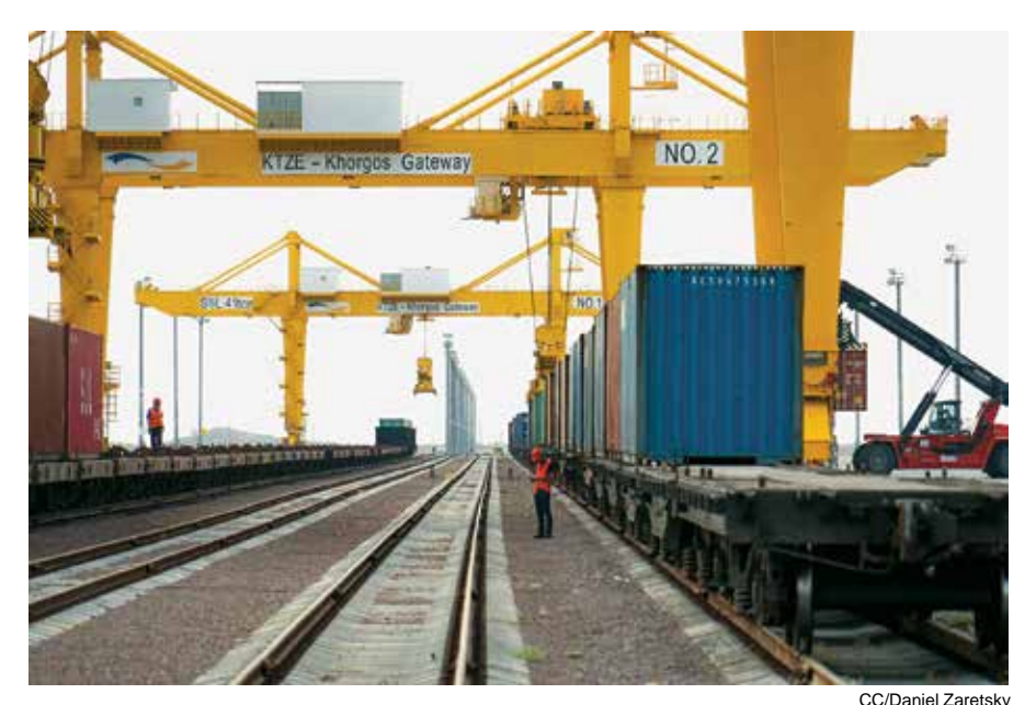
A BRI project, the Khorgos Gateway Dryport on the China-Kazakhstan border, formerly a transit point on the Silk Road, is now the location of a massive industrial zone and logistics center.

industries to provide industrial grade materials to the world market.