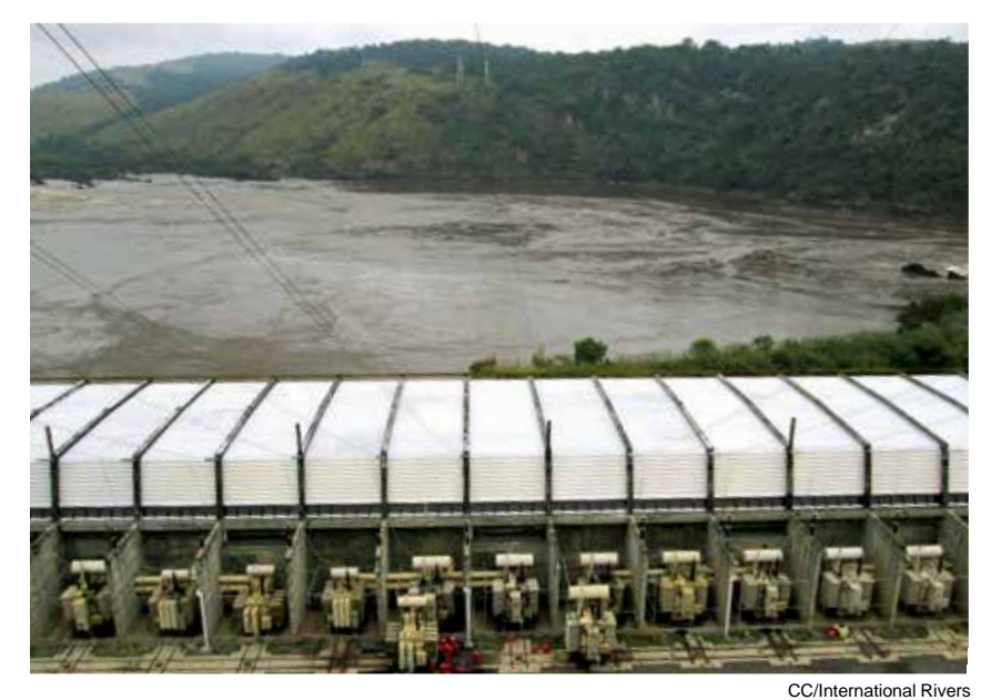
Many speakers urged the completion of the Grand Inga III hydroelectric dam on the Congo River, part of a proposed seven-dam interregional system, the largest in the world. When built, the system will provide 40 GW of new, reliable electricity for millions currently altogether without it.