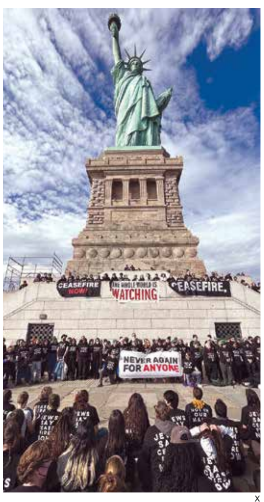
A ceasefire rally at the Statue of Liberty in New York Harbor, organized by Jewish Voice for Peace—NYC, Nov. 6, 2023.

After the results were announced, The New York Times reported that thousands of pro-Palestinian protesters took to the streets of Lower Manhattan, rallying at numerous locations including City Hall