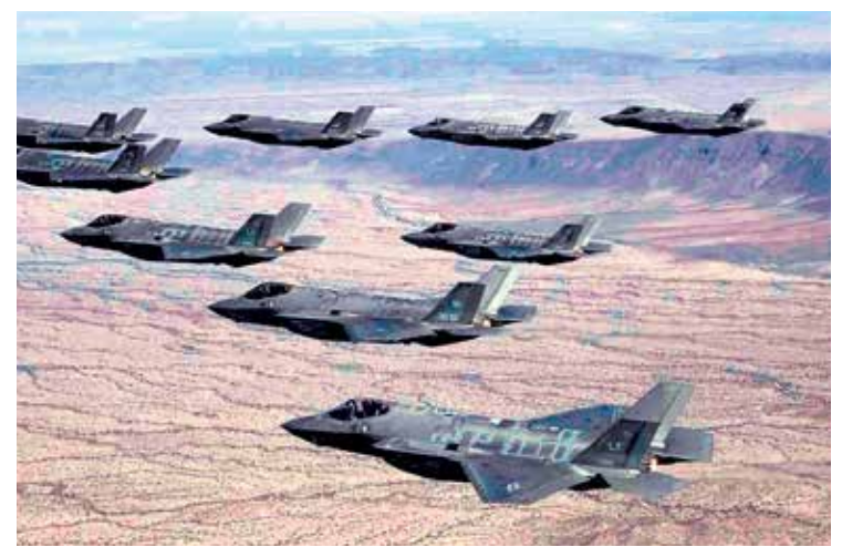
Luke Air Force Base Courtesy Photo

Number four is Boeing . They make Apache attack helicopters, and the F-15 fighter jets which are being heavily used in Gaza and elsewhere. Five is General Dynamics . Six is L3Harris Technology ; they produce