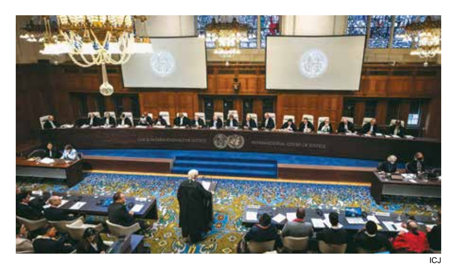
The World Court hears public testimony in South Africa's suit of Dec. 29, 2023, requesting measures to stop Israel from violating the Convention on Genocide in Gaza. The Hague, Jan. 12, 2024.

national Court of Justice, as to what Israel and other nations have done to prevent genocide. Unfortunately, the opposite has happened: There was no prevention, but as a matter of fact, an escalation. So let's see what happens now, because as far as I know, if the International Court of Justice makes a ruling based on this more recent request by the South African government, the ball goes back to the UN Security Council and they have to do something, and if that doesn't work, it goes to the UN General Assembly