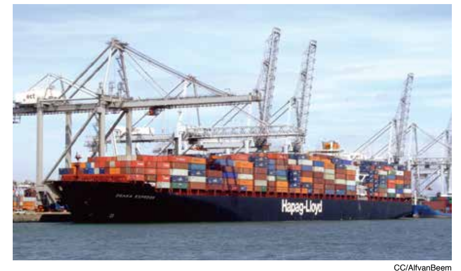
The Osaka Express container ship at the Port of Rotterdam.

Zepp-LaRouche: I think the present neoliberal economic system which dominates much of the trans-Atlantic sector and which reaches out into the former colonized countries, by determining the terms of trade and export and import and credit facilities and so forth—that [system which] is [only] geared to make the