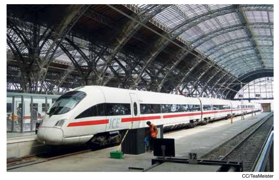
German-built, high speed intercity express trains (ICE) are one of the surviving symbols of the "road not taken" in the advanced sector. After U.S. President Nixon dumped the fixed exchange-rate system in 1971, the physical economy collapsed by steps and stages. Here, a German ICE train, Leipzig station, 2018.

Zepp-LaRouche: That's a very difficult question. I think what these rabbis are doing is exactly the right thing. And one can only hope that we can have more