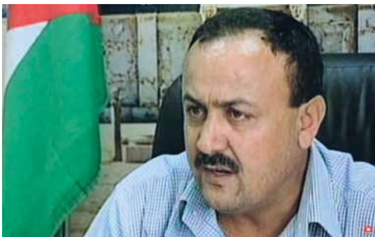
Tomorrow's Freedom, trailer

A former Israeli Ambassador to France said of Marwan in the film, “He knows us very well.... He is the kind of man with whom you could strike a deal and he will respect it.”