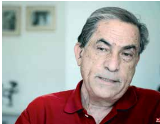
Tomorrow's Freedom, trailer

When Barghouti was asked by his interviewer in jail if he supported killing Israeli civilians, he stated emphatically that the Israelis were killing women and children, kidnapping Palestinians, and demolishing their homes. He stated that Palestinians have a right to resist this oppression by any means necessary, but killing Israeli civilians in Israel, he made clear, “No, there should be no killing of Israeli civilians in Israel or Palestinian civilians in Palestine. That should not be part of the game.”