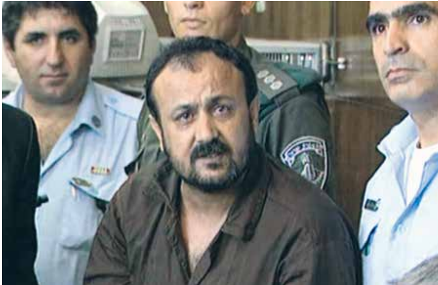
Tomorrow's Freedom, trailer