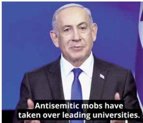
Benjamin Netanyahu Facebook page

Super PACs have no spending limits because they do not contribute directly to candidates’ campaign committees, but can spend money instead to “advocate for or against political candidates,” often by purchasing “attack ads” which target the candidate’s opponent. In California, a Democratic California state senator named Dave Min is running for Congress. He is generally pro-Israel and does not support a Gaza cease-