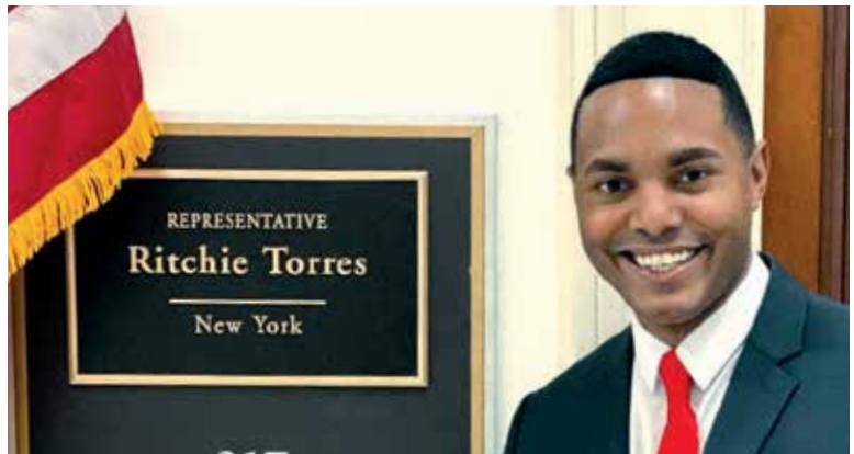
Rep. Ritchie Torres X page U.S. Congressman Ritchie Torres, a major recipient of AIPAC funding.

According to the campaign finance watchdog organization Open Secrets , Torres has received