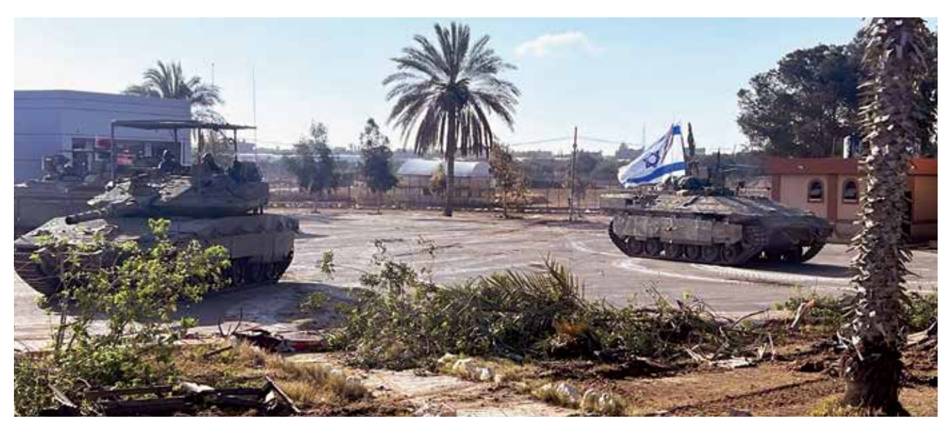
DF X page

So it is absolutely cynical, and it is the utmost psychological warfare on top of the massacre taking place. In light of all of that, I think the suspension