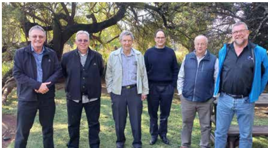
The Stratek Global Executive Team meets near Pretoria at Preller House, Pelindaba, in 2022. CEO Kelvin Kemm is at center in light-colored jacket.

Four components are key to this safety: (1) Extremely heat-tolerant TRISO fuel; (2) helium as the primary coolant; (3) very low excess reactivity 8 at fuel loading, allowing thermal expansion of the fuel to stop any runaway reaction without control rods; and (4) passive removal of decay heat (the heat generated by the natural radioactive decay of one isotope to another) in a manner that requires no operator intervention and no electric power whatsoever.