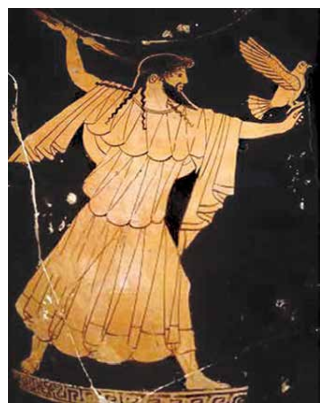
"The followers of Zeus, are, intrinsically, self-doomed to a probable species-extinction in the presently looming, nuclear-warfare-like prospects for the future of mankind." Shown: Zeus with his eagle and thunderbolt, Athenian red-figure amphora, 5th Century B.C.

ages.) What, therefore, is the challenge to society now to be set before us?