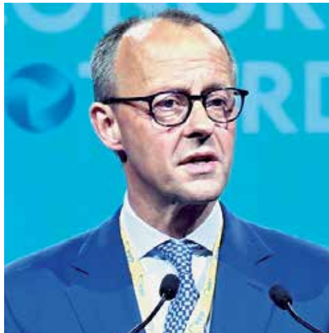
CC/European People's Party

As you can see, there is flux, and that has to do with the fact that people vacillate between obedience to the NATO narrative and a perceived, fundamentally differ-