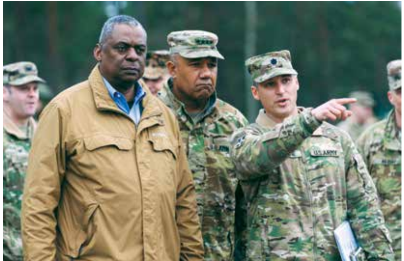
Defense Secretary Lloyd Austin—with U.S. troops who will train Ukrainian troops—had his first conversation with his Russian counterpart, Andrey Belousov.