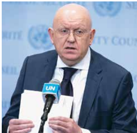
Vasily Nebenzia, Permanent Representative to the UN of the Russian Federation, on military activity in Crimea: The U.S. has become a participating party in the war.

facto , almost being at fully declared war? So, I think this came, really, at the absolute urgent moment, and one can only hope that the kind of civilized dialogue among the nuclear superpowers would become the normal standard again.