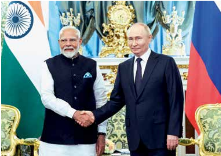
PIB of India

Indian Prime Minister Narendra Modi's expanded cooperation with Russian President Vladimir Putin for advanced development troubles the West's elites.