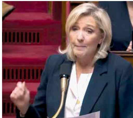
Marine le Pen Facebook page