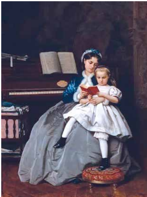
"Human life, is the characteristic manifestation of mankind's specifically manifest-as-demonstrated, noëtic performances shown by the crucial evidence of the living human mind." Here, "The Reading Lesson," Auguste Toulmouche (1865).

Such, precisely, is the case in fact: it is located, precisely, in the actually noëtic powers specific to the human mind: in the higher source of the specifically higher "strata" of the actually creative (specifically noëticly creative) powers specific to the individual member of the human species: to the distinction of the human (noëtic) powers of individual, and also shared experiences, of uniquely human creativity: a creativity, which, properly understood, foresees the actual future: as all true creativity of the human mind, as in physical