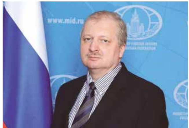
Embassy of Russia in the U.S.A. Ambassador Alexander Nikitich Darchiev, Russia's new ambassador to Washington.

And I can understand that they have a lot of work to do, because they were denied any opportunity to communicate with the American public, at the people to people level. And that is very important, because a nonsensical narrative is there in America—all kinds of things. It’s almost like when George Orwell wrote about matters, that he could have been referring to a situation like in the Western world today. A kind of contrarian view is blocked—it’s absolutely censorship. Even American writers and thinkers, their point of