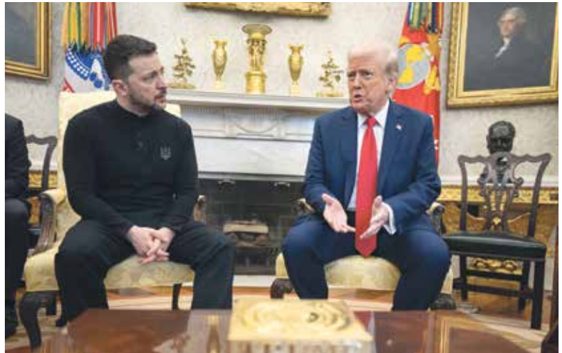
President Donald Trump speaks with Ukrainian President Volodymyr Zelensky, Feb. 28, 2025.

So, there is now a kind of role reversal here. The United States is pushing for this cooperation with Russia, and from the statements in Moscow, I have