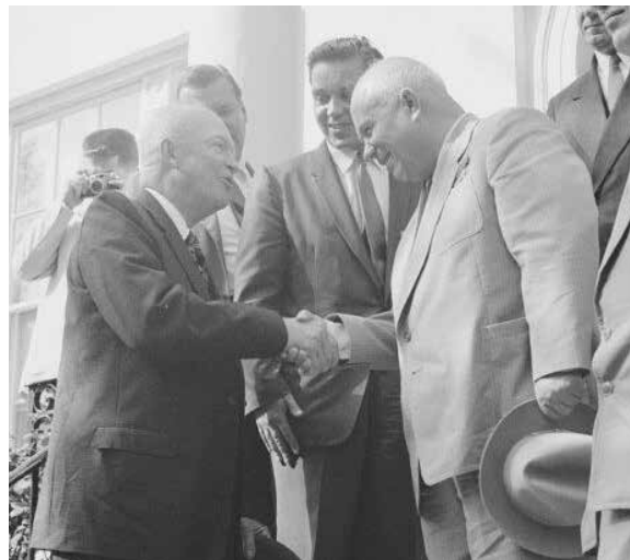
Library of Congress