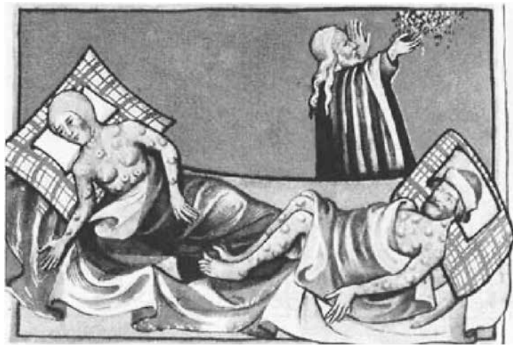
We are rocketing toward a New Dark Age, which will be much worse than what Europe experienced in the 14th Century with the Black Death. This illustration of the Plague is from the Toggenburg Bible, 1411.

If we do that, other nations will join us. I can assure you that Russia, China, and India will probably join us, if we do that! Now, we're demoralizing them. If we do