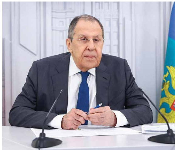
Ministry of Foreign Affairs, Russian Federation

What can you say about what you see around Trump?—because it's still a confusing picture.