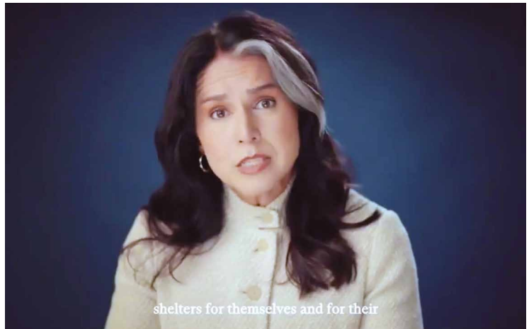
Tulsi Gabbard X page

Yet, this one bomb, that caused so much destruction in Hiroshima, was tiny compared to today's nuclear bombs. The bomb that was dropped on Hiroshima had a yield of just 15 kilotons of TNT, whereas today's nu-