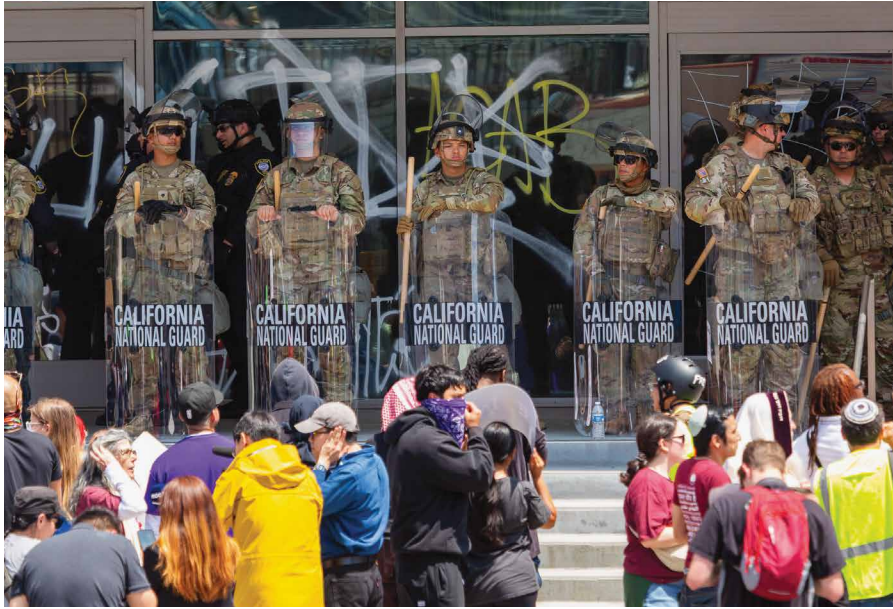
U.S. Northern Command