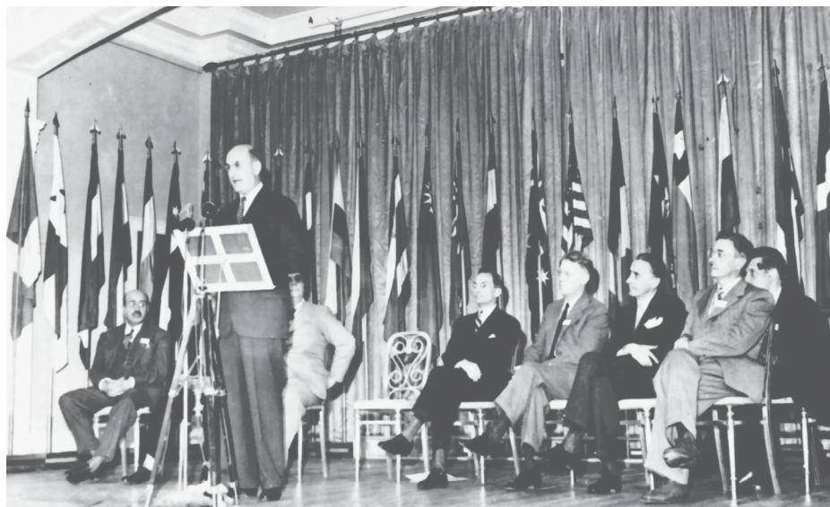
Speaking is U.S. Secretary of the Treasury, Henry Morgenthau, president of the conference, at the opening session of the 1944 Bretton Woods International Monetary Conference.