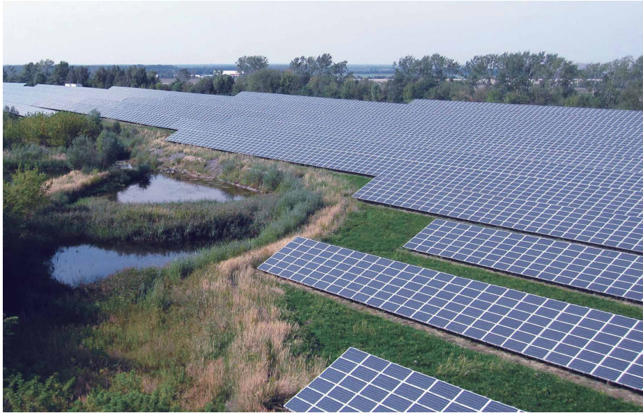
GEOSOL Gesellschaft für Solarenergie mbH