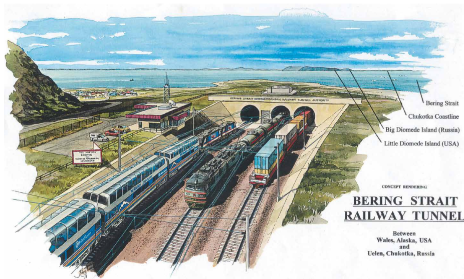
Artist's conception of the Bering Strait tunnel, commissioned by Cooper Consulting Co. for Alaska Governor Frank Murkowski.

Let me just preface our discussion with a short description of what we are trying to do. We are not looking at this event just as passive observers, because