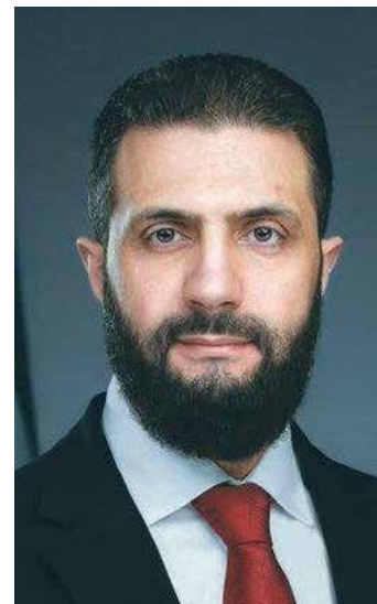
Syrian Arab Republic

Miraculous transformation of Abu Mohammad al Jolani— From ISIS headchopper to “respectable” President of Syria.