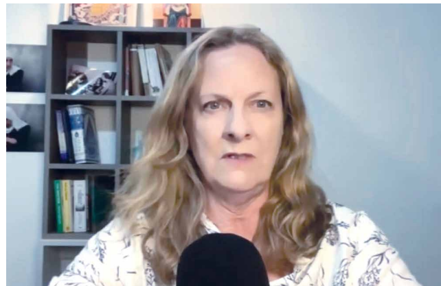
The LaRouche Organization