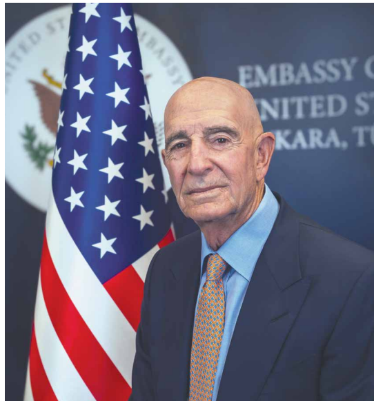
U.S. State Department United States Ambassador to Türkiye, Thomas Barrack.

unleashed is a race for domination of resources in West Asia. And those resources don't only include hydrocarbons, oil; they include most importantly rare earth minerals and water. Those two commodities are going to be the new oil, in a sense. Because if America wants to release itself from the economic grip of China through the rare earth mineral trade, then it's going to have to seize territory where it can mine rare earth minerals. And, of course, that was part of the deal in Ukraine. That was the attraction of the Ukraine deal for Trump.